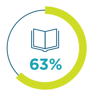
report difficulty reading<sup>11</sup>